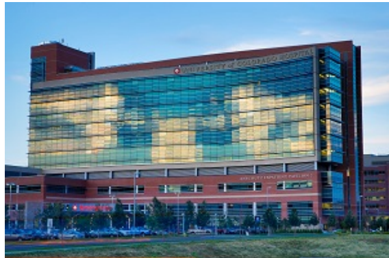
UCHealth again ranks as No. 1.

UCH is also ranked among the nation's best in nine specialties including No. 2 in pulmonology & lung surgery.